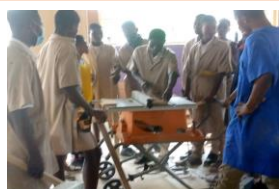
Tema Industrial Mission Vocational School