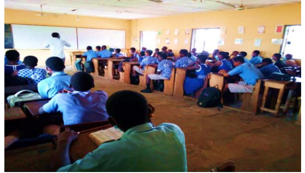
Ascension Presby JHS, Koforidua

With the support of Foundation for the Nation (YFCI) we intensified our weekly school worship program in 7 Ministry Regions, including Ashanti, Central, Volta, Eastern, Greater Accra and Tema.