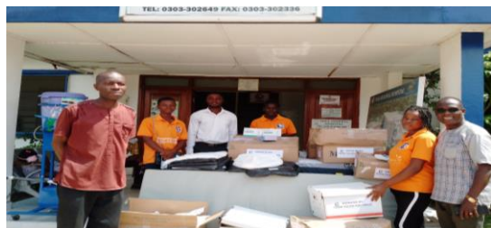
Tema Regional Hospital

Tema Regional Board and volunteers donated household, learning and teaching materials to Schools, young leaders, YFC members and other institutions. Two hospitals and 10 schools received medical and educational materials and equipments.