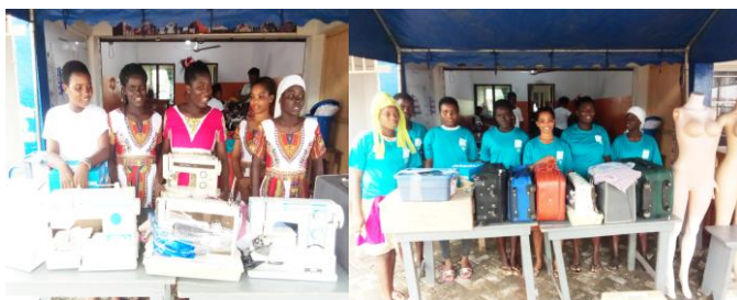
National Skills Training Centre-Tema