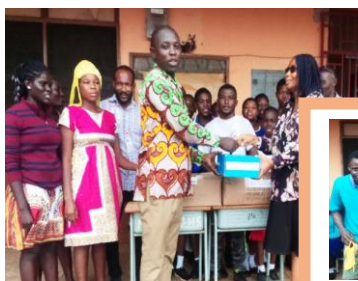
Manhean Anglican JHS